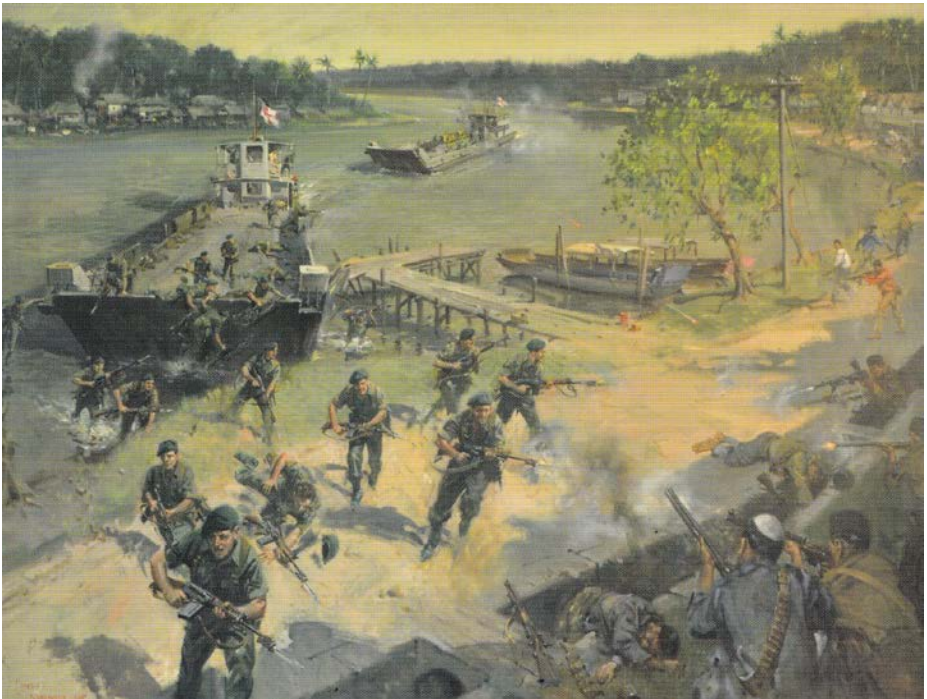
Painting by Terence Cuneo, courtesy of the Officers Mess 42 Commando

All the hostages were released alive, albeit frightened and some roughed up, but five Royal Marines were killed in the action. 19 rebels were killed and over 30 taken prisoner. Unknown to the relieving force, over 200 armed rebels had gathered in Limbang.