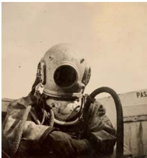
Copperhead Trinco 1951 & BULWARK 1954-56