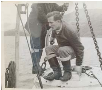
Observation Chamber RECLAIM 1959 & Kai Tak 1964