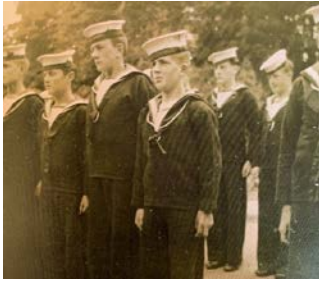
TS Indefatigable 1946 & GANGES 1948